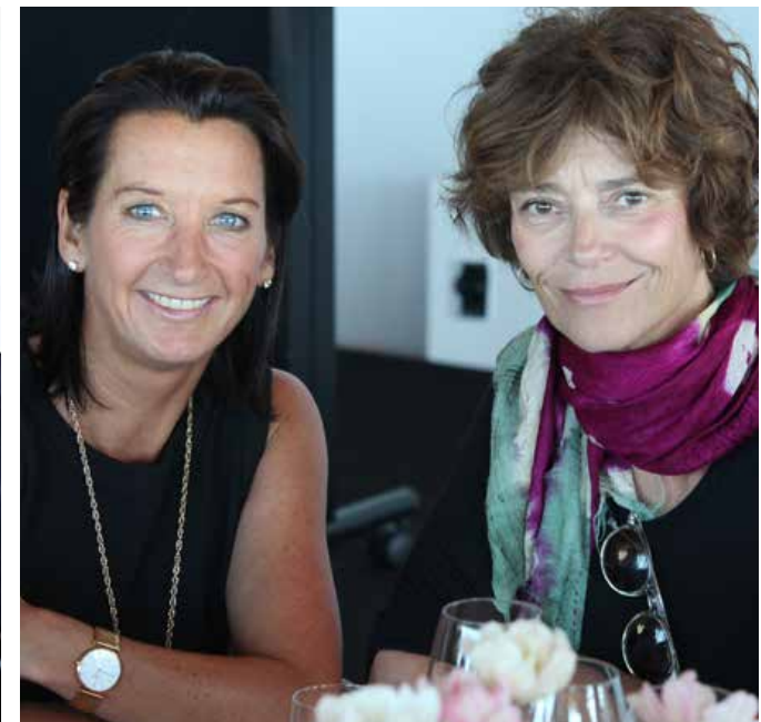
Layne Beachley AO + Rachel Ward AM