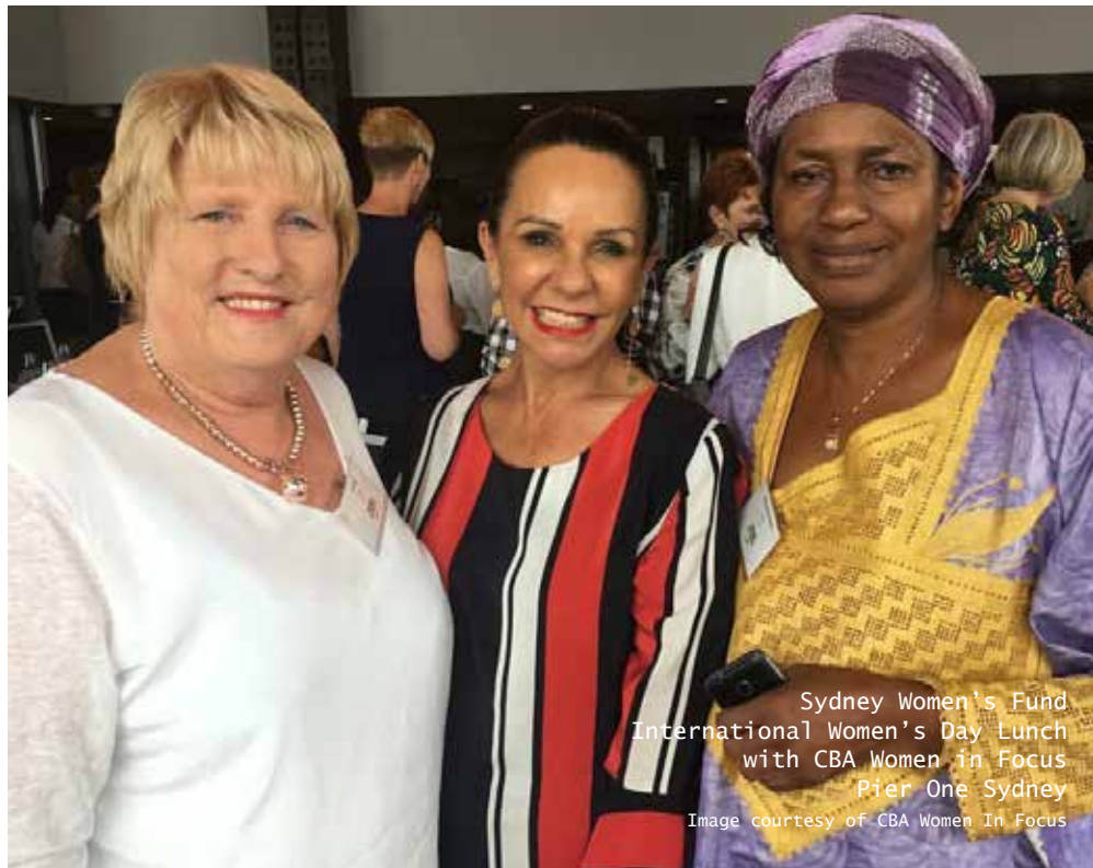
Sydney Women's Fund International Women's Day Lunch with CBA Women in Focus Pier One Sydney