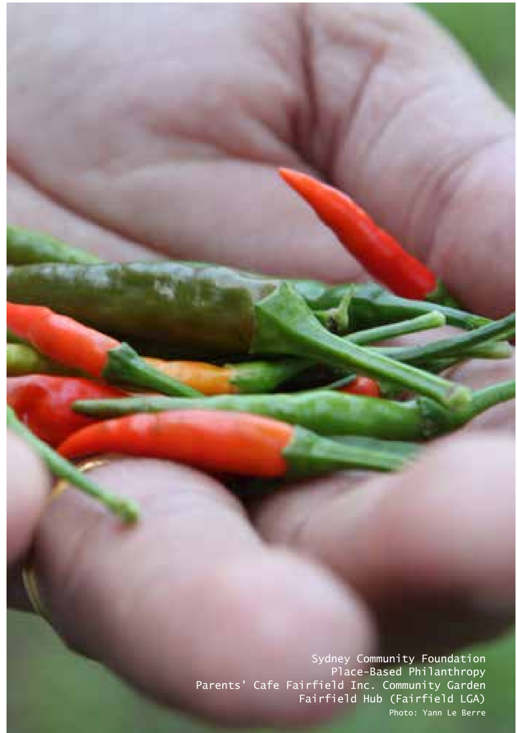
Sydney Community Foundation Place-Based Philanthropy Parents' Cafe Fairfield Inc. Community Garden Fairfield Hub (Fairfield LGA)

In 2015, our third 'hub' was established in response to a community-identified need to support at-risk high school students suspended or chronically disengaged from education. Over just two years, the RISE program has provided meaningful assistance to 47 young people and grown from one referring high school to eight. It was featured on ABC Lateline as a successful pilot program addressing student suspension.