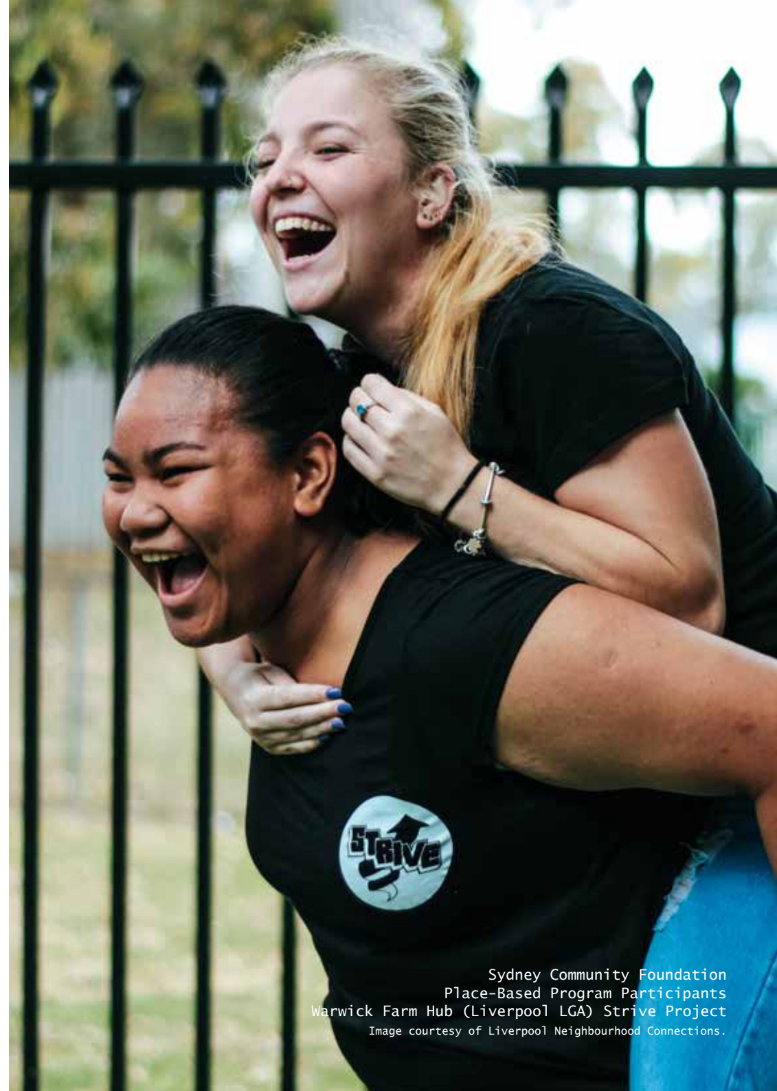
Sydney Community Foundation Place-Based Program Participants Warwick Farm Hub (Liverpool LGA) Strive Project