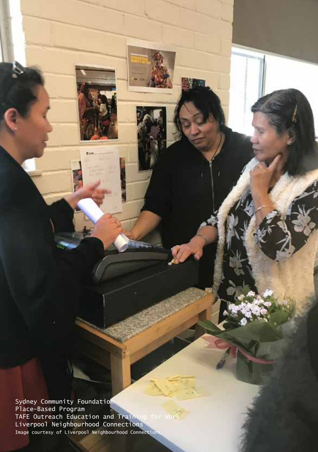
Sydney Community Foundation Place-Based Program TAFE Outreach Education and Training for Work Liverpool Neighbourhood Connections