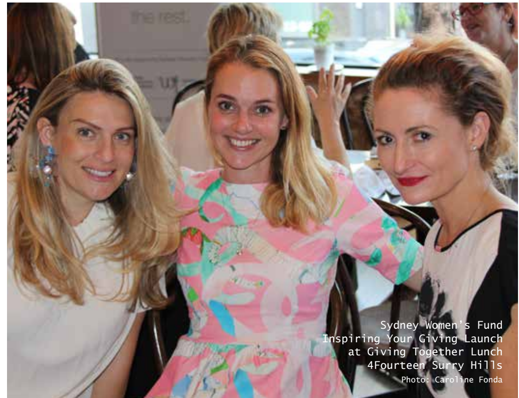
Sydney Women's Fund Inspiring Your Giving Launch at Giving Together Lunch 4Fourteen Surry Hills