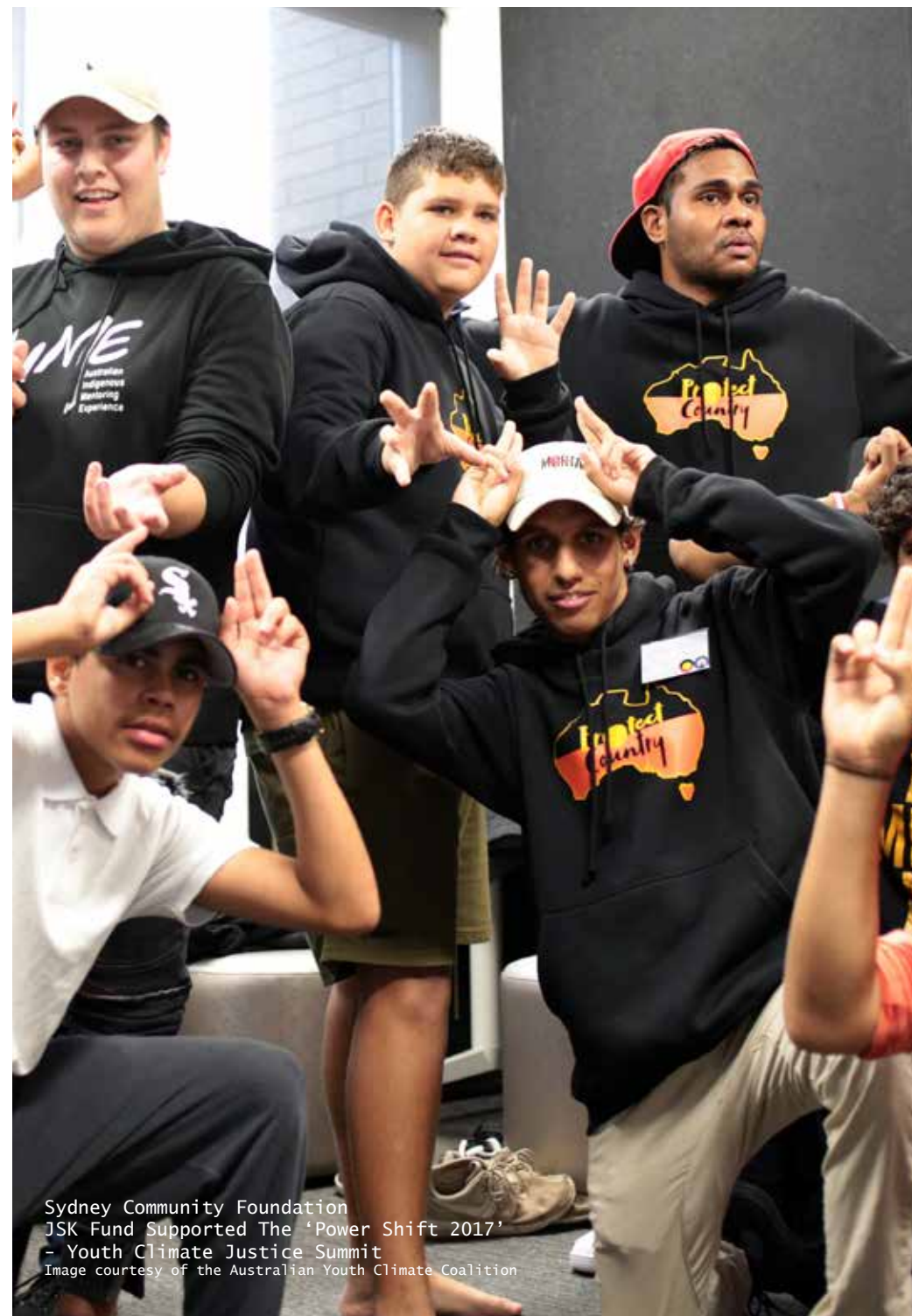
Sydney Community Foundation JSK Fund Supported The 'Power Shift 2017' - Youth Climate Justice Summit

"The opportunity to travel to Sydney to undertake my internship would not have been possible without the support of the JSK Fund. The support relieved the financial burden of travelling interstate and the associated costs such as accommodation and living expenses. I am very grateful to the JSK Fund and to have been part of the Aurora Project's Internship Program as a defining part of my journey within the legal profession"